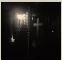
Salem Evangelical Lutheran Church 3825 Norrisville Road Jarrettsville, MD 21084