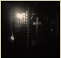
Salem Evangelical Lutheran Church 3825 Norrisville Road Jarrettsville, MD 21084