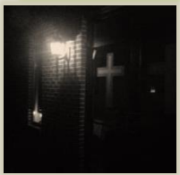
Salem Evangelical Lutheran Church 3825 Norrisville Road Jarrettsville, MD 21084