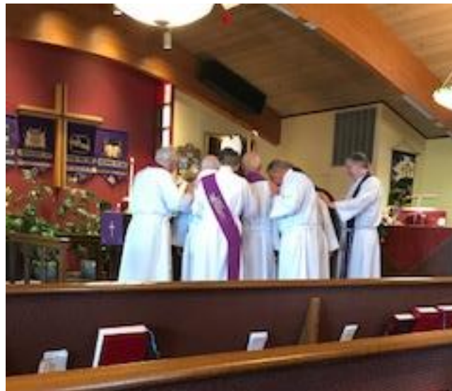
The moving “Laying on of Hands” by other Pastors from our Synod