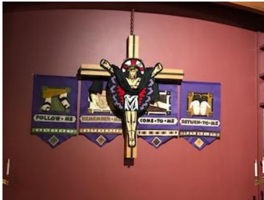
We observed Holy Week with Communion, Washing of Feet, and “Lenten Sketches” cantata.