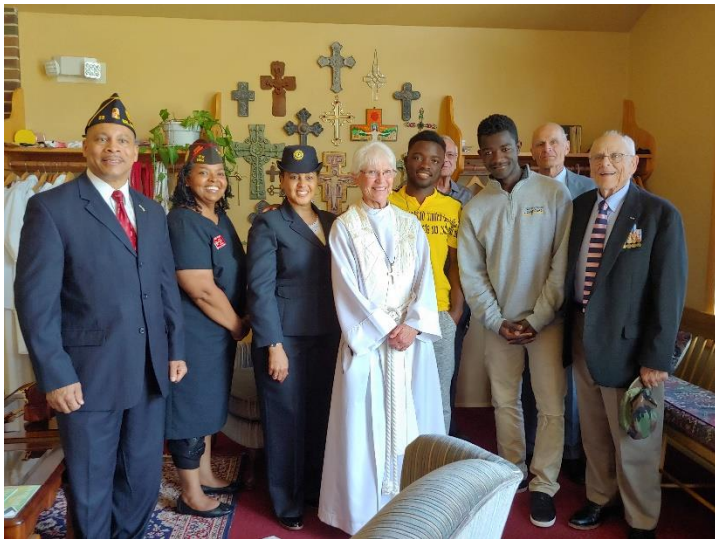
We honored our Veterans on Memorial Day, and Sang favorite Patriotic Songs!