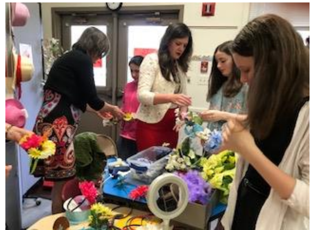
We decorated hats and made "Fascinators" to wear.