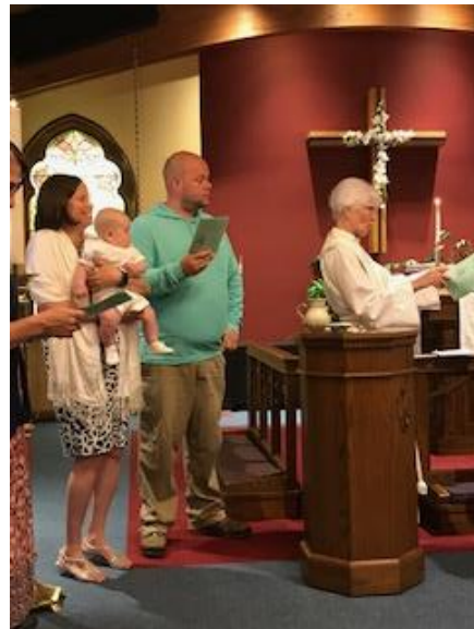
.....AND WE BAPTIZED A NEW CHILD OF GOD IN THE NOTTINGHAM FAMILY (and re-sprinkled some of our congregation's children while we were at it, to re-affirm their baptisms!)