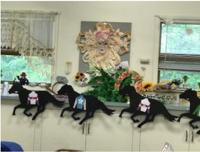
We went to the Ascot Races

We started off Spring with a bang, at our traditional tea party - My Fair Lady- was the theme and we were treated to the entire story of Eliza Doolittle's adventures while eating delicious "high tea" and treats.