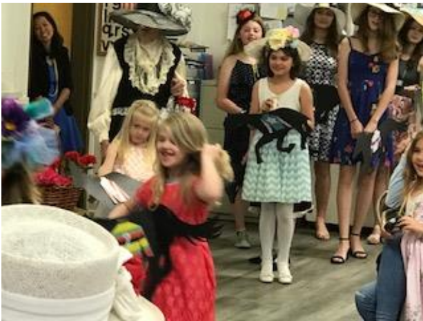
Our speedy acolyte won!