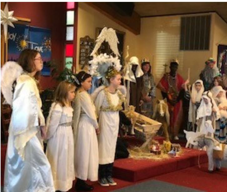
THEY ALL CAME TO BETHLEHEM.....