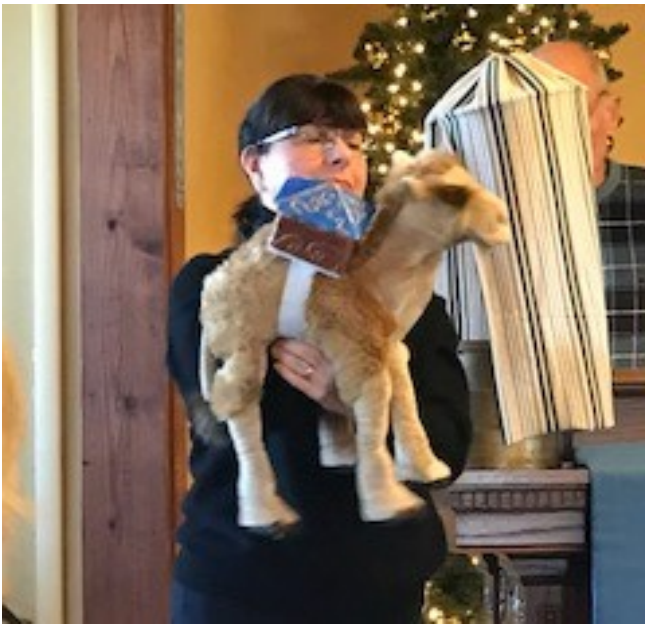
WISE MEN (AND THEIR CAMELS) FOLLOWED THE STAR.....