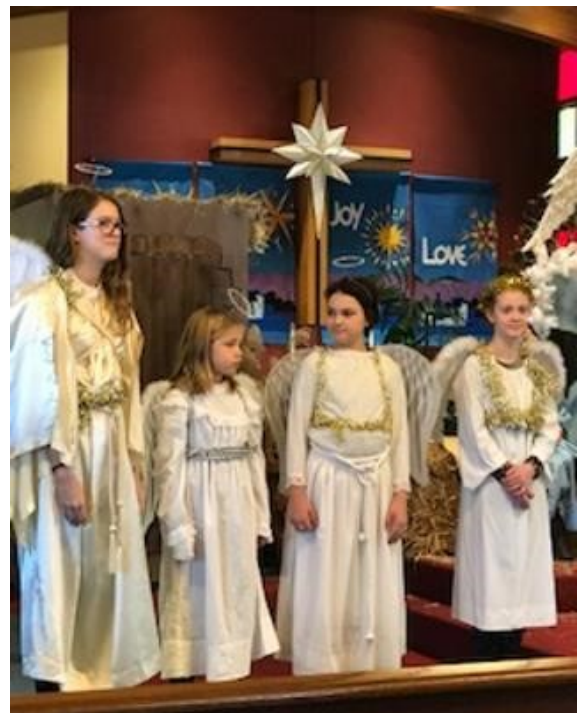
ANGELS WATCHED OVER THEM.....