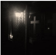
Salem Evangelical Lutheran Church 3825 Norrisville Road Jarrettsville, MD 21084